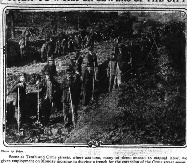
Scene at Tenth and Orme streets, where 300 men, many of them unused to manual labor, were given employment on Monday morning in digging a trench for the extension of the Orme street sewer.