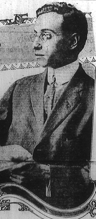
LEO M. FRANK IN A CHARACTERISTIC ATTITUDE.