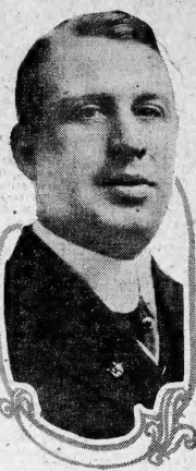
Who was elected worshipful master of Gate City lodge, No. 2.